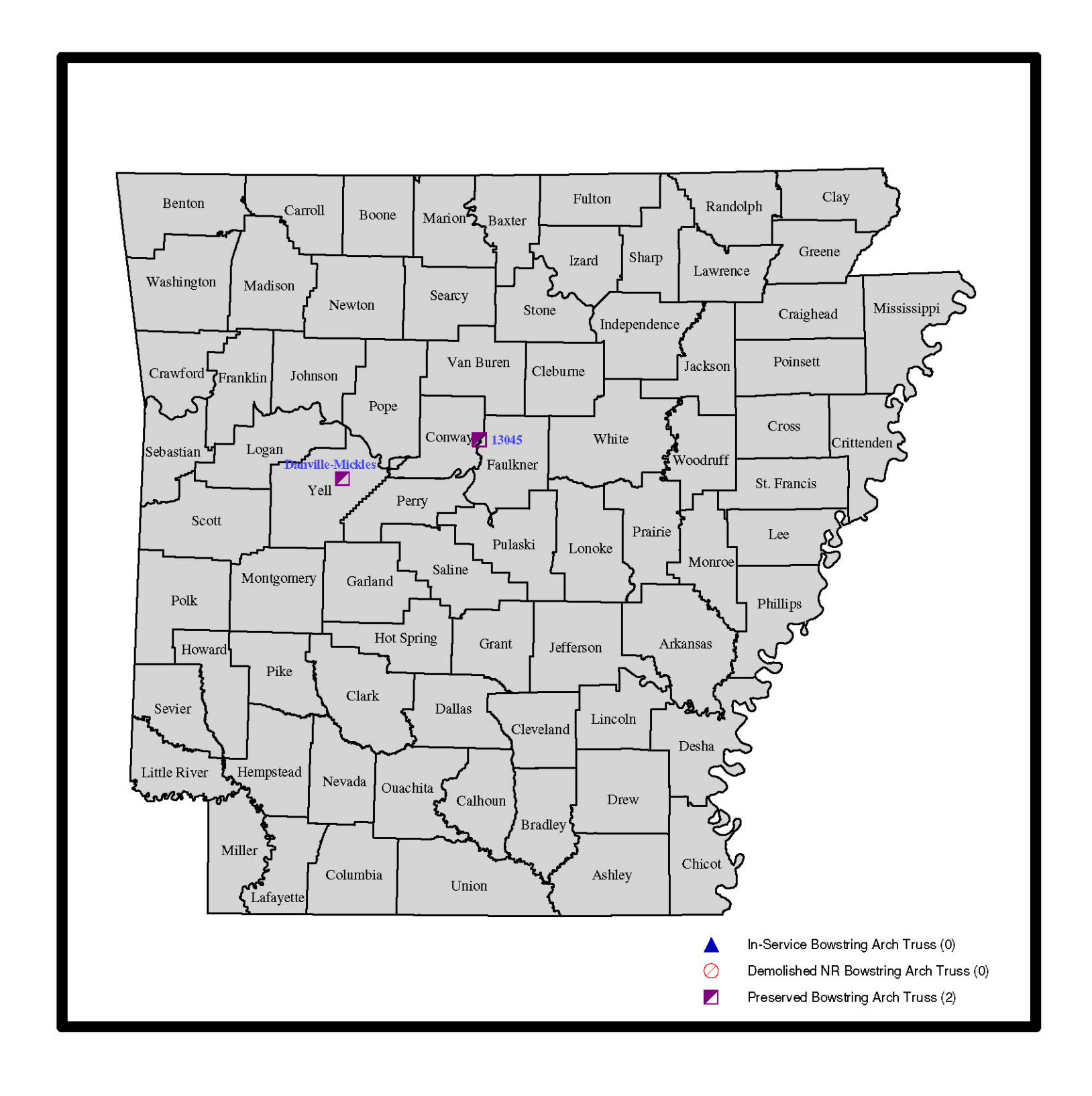
Bowstring Arch Truss Bridges